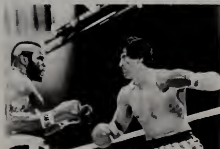
The Rocky Saga